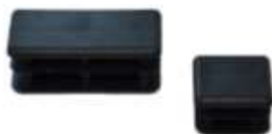
421012 &amp; 421007