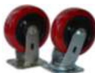
404060 &amp; 404059