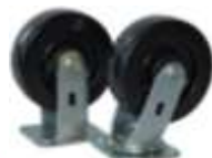
404010 &amp; 404009