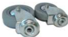
402024 et 401006