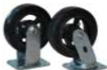
404007 &amp; 404006