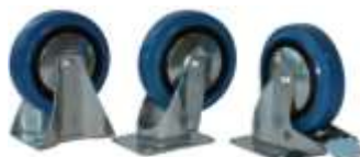
403006, 403004 &amp; 403005